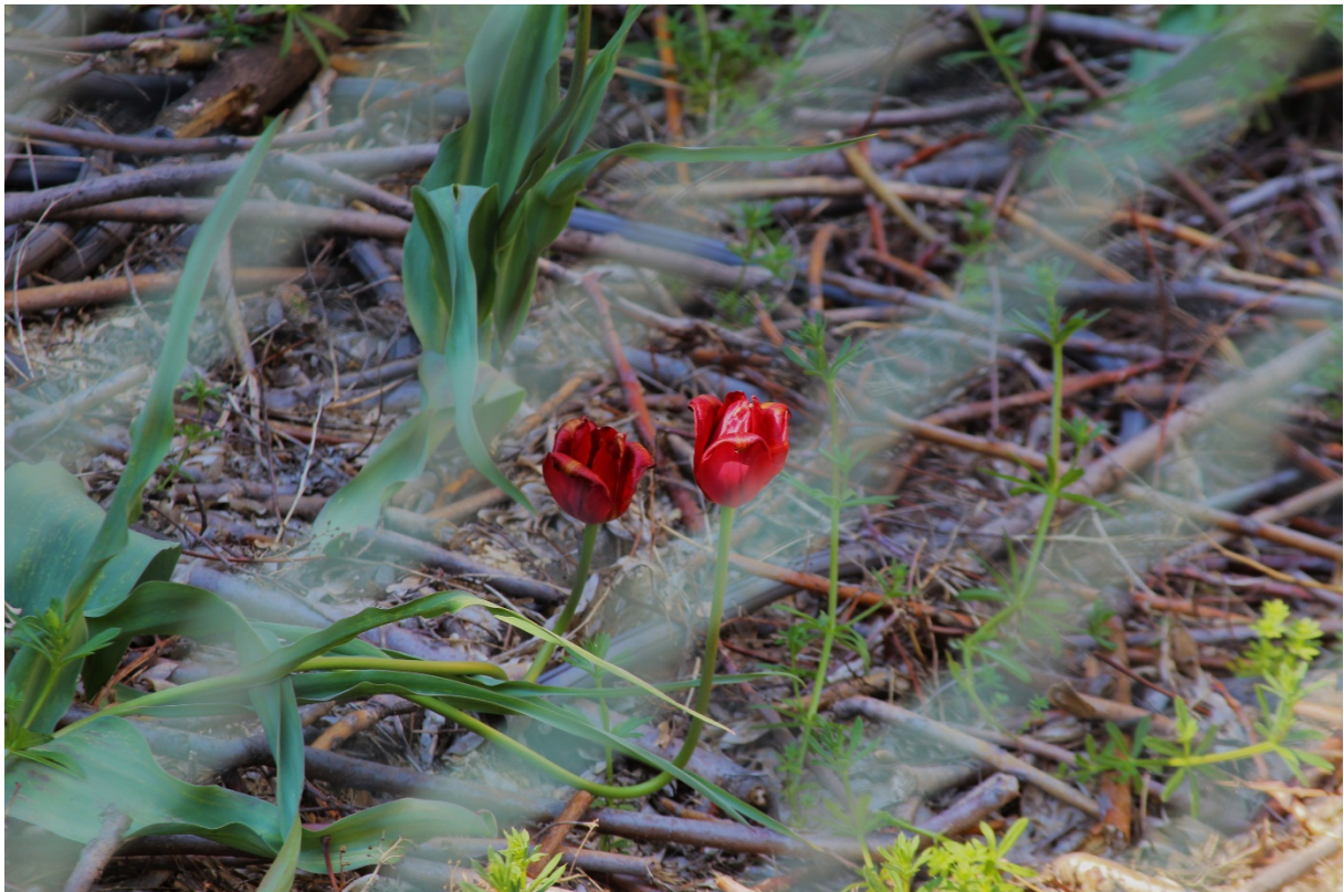
Skopje's atriums; city centre (spring, 2020)